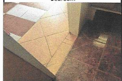
Different floor tiling