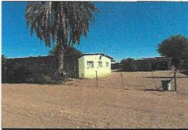
View from street