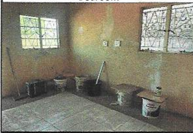
Living area (lounge/kitchen)